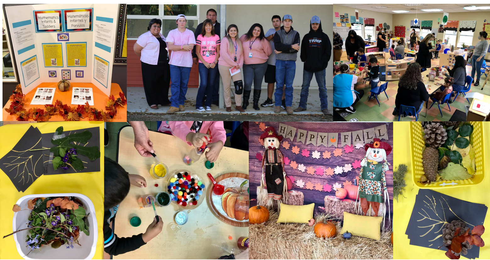
Photographs from Educational Services Pink October & Children's Services Family Night Events

Communicate ● Collaborate ● Operate ● Educate